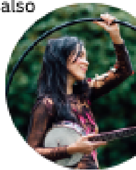
music & movement by Ginalina