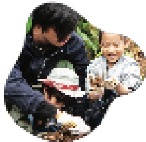
Connect with families