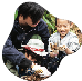
Connect with families