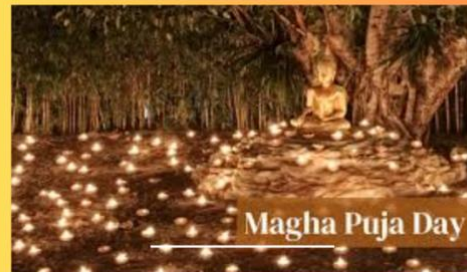
Magha Puja Day

The Lantern Festival is a vibrant celebration observed across various Asian cultures, marking the first full moon of the lunar new year. Celebrated in China, Taiwan, Hong Kong, Vietnam (as Tết Nguyên Tiêu), South Korea (as Jeongwol Daeboreum), and parts of Southeast Asia, the festival symbolizes light, renewal, and hope. People illuminate the night with lanterns—floating them in the sky, on water, or carrying them in processions—while engaging in traditions like solving lantern riddles, eating symbolic foods such as tangyuan (glutinous rice balls) or red bean rice, and enjoying cultural performances like dragon and lion dances. The festival fosters unity, prosperity, and spiritual well-being across diverse communities.