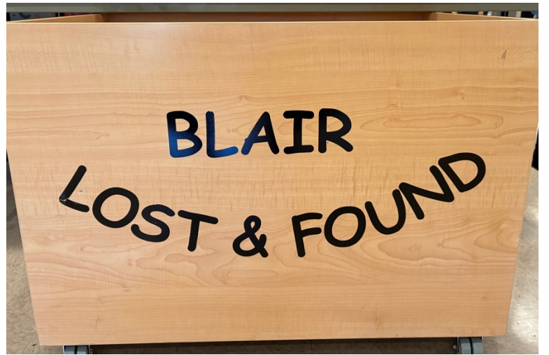
On display! Donated Tues May 26